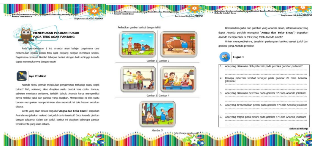
Figure 3. Reading Prediction

The teacher asks students to pay attention to the series drawing carefully. Next, the teacher tells students to pay attention to one of the pictures and asks students what exactly happened to the picture. The teacher tells students to read the reading section of the picture that has been predicted. When students read the first part of the story, the teacher directs a discussion by asking questions. Then the teacher told students who were convinced that the predictions were correct to read aloud in front of the class part of the reading that supported their predictions. Other students can respond. In the learning process with the DRTA strategy (Directed Reading Thinking Activity), the teacher conducts guidance to students. This is in line with Rahim's opinion (2009), which states that teachers observe children when they read to diagnose difficulties and offer assistance when students find it challenging to interact with the reading material.