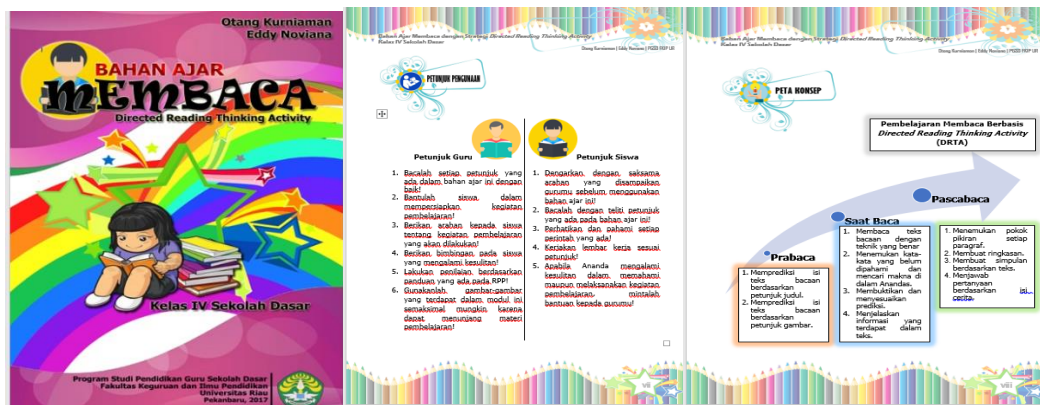
Figure 2. (a) Cover Of Teaching Materials; (b) Instructions In Teaching Materials; (c) Concept Maps

The format and preparation of these teaching materials are modified from the structure of teaching materials according to the Ministry of National Education, which consists of (1) cover, (2) preface, (3) table of contents, (4) instructions for use, (5) concept maps, (6) competence to be achieved, (7) assignments, (8) work instructions, (9) bibliography. The cover of the teaching material is shown in the picture below.